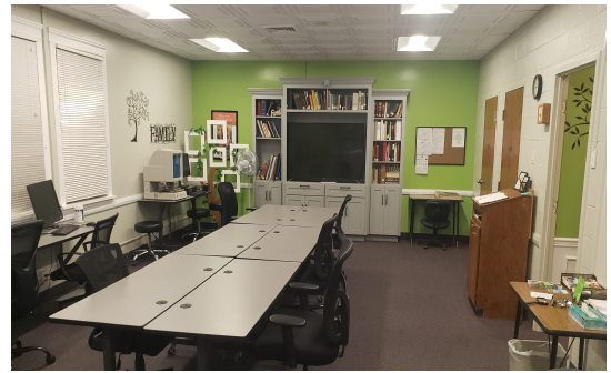
667 10th Street NE, East Wenatchee

The Douglas PUD Auditorium has served us very well for many years, so we were most disappointed to learn that they were closing their building to outside meetings as of July. They were having serious security issues, and felt they could no longer guarantee safety, either for their employees or meeting attenders.