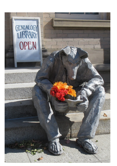
This is an illustration, not the real thing!