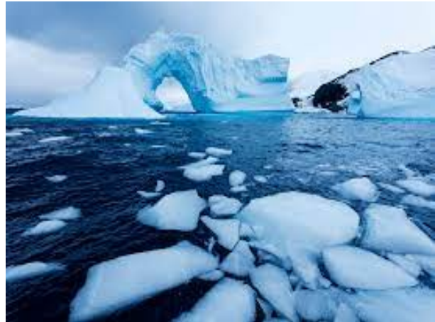
Imagine being this cool!